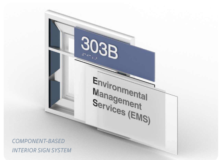
COMPONENT-BASED INTERIOR SIGN SYSTEM

Reach out to start your next signage project.